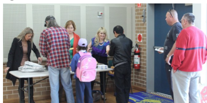
Fathers Day BBQ 2013