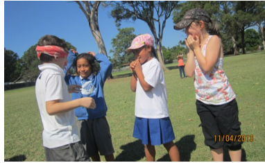
Harmony Day 2013

Information regarding the day will be sent home early next week.