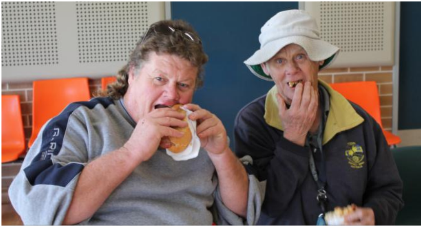
Fathers Day Breakfast